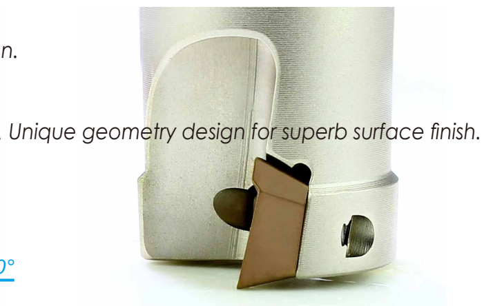
. Low cutting force due to large rake angle.